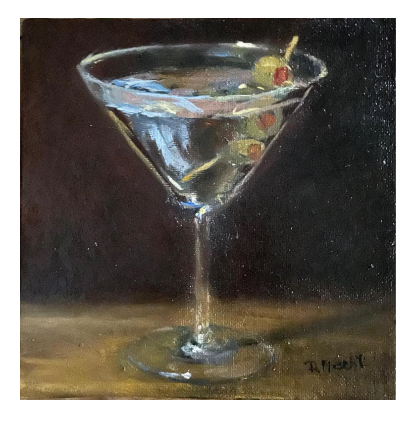
Diana Hecht Cheers to Hollywood Featured in our A Toast to Hollywood exhibition