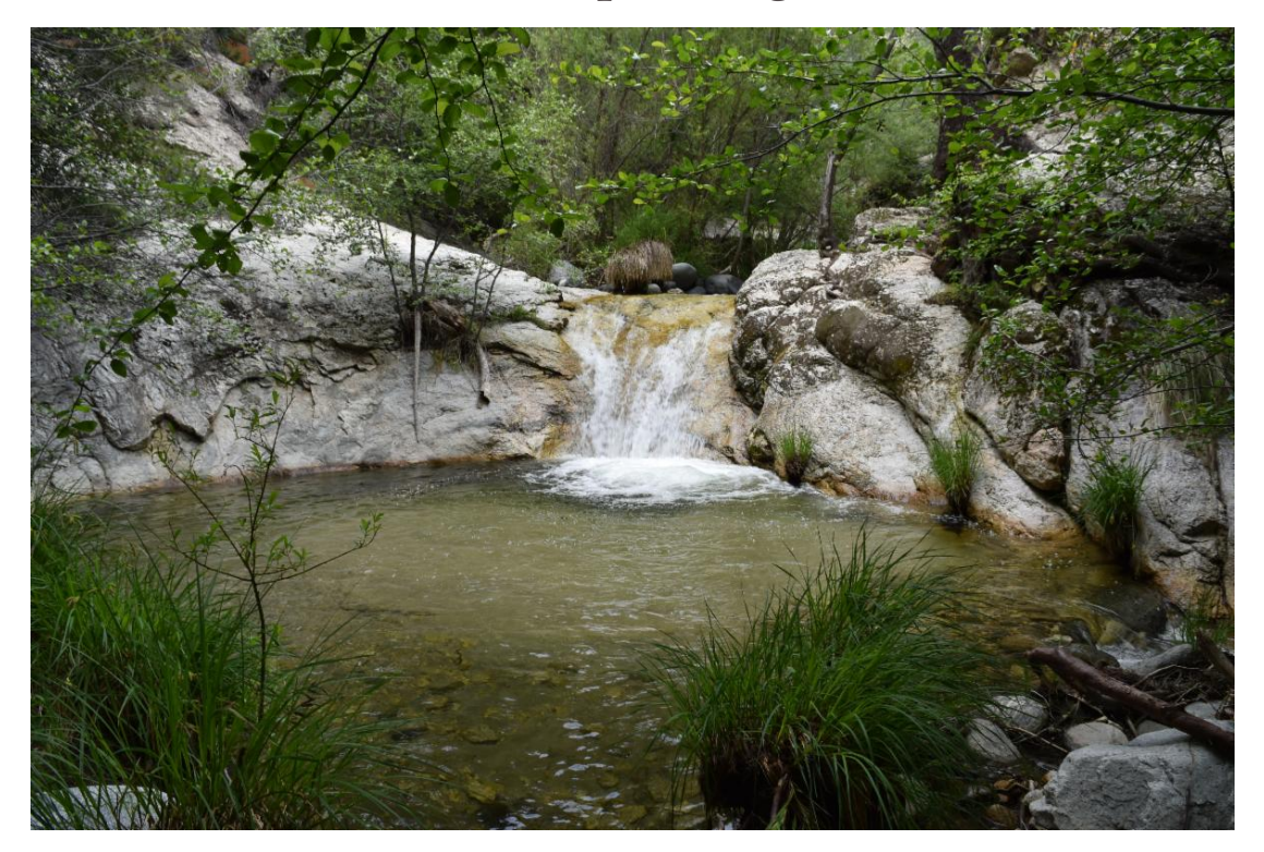
Painting the Arroyo: Switzers Falls