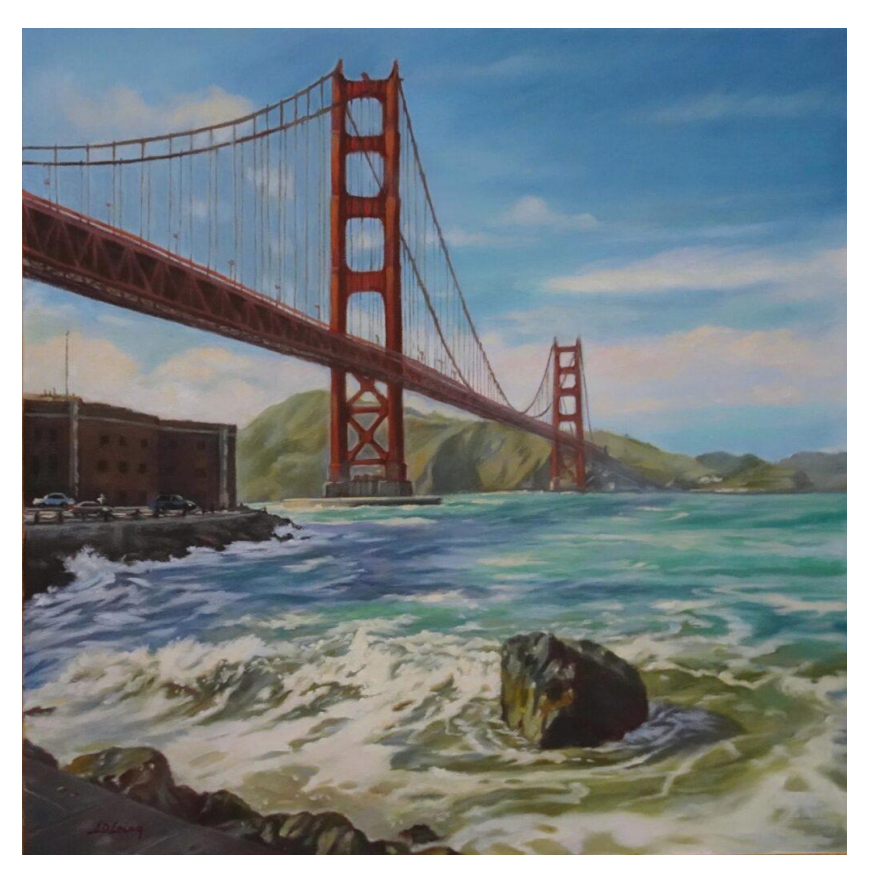
Amy Leung Bridge Over Troubled Water On View in California Dreaming